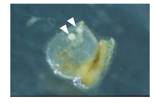
Figure 8. Two embryos in the same embryo sac (indicate by arrows). Embryo sac culture in the Oriental hybrid "Casablanca" X Asiatic hybrid "Montblanc" (CB X MB) (OA crossing type) 71 DAP. A group of cells of the nucellor tissue divided and formed an apomictic budding. The apomictic embryo was in the vicinity of the micropyle. (13\times) .