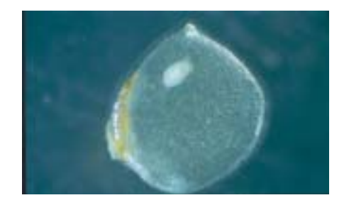
Figure 4. Embryos and embryo sacs (without endosperm) were picked up under a dissecting microscope from the ovules 71 DAP and cultured on the embryo culture medium. Oriental hybrid "Casablanca" X Asiatic hybrid "Montblanc" (CB X MB) (OA crossing type) (13\times) .