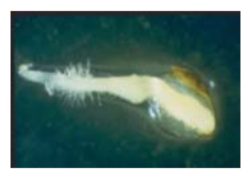
Figure 7. In the embryo sac culture, embryo germinated 125 DAP in the Oriental hybrid "Casablanca" X Asiatic hybrid "Montblanc" (CB X MB) (OA crossing type) (13×).