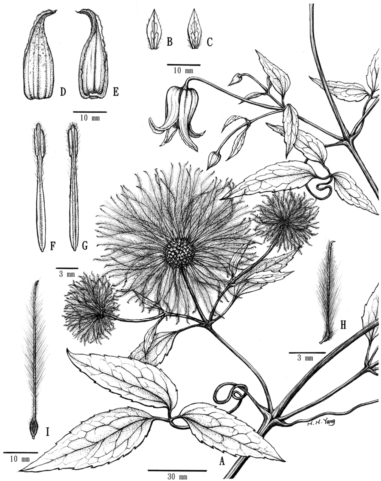
Figure 2. Clematis pseudootophora . A, habit; B, bracteole (adaxial view); C, bracteole (abaxial view); D, sepal (abaxial view); E, sepal (adaxial view); F & G, stamens; H, carpel; I, achene.