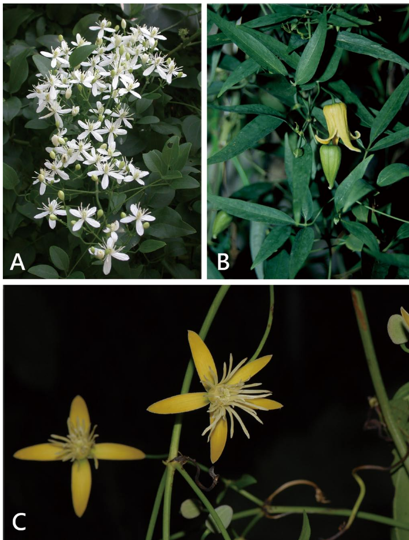
Figure 4. Photographs of Clematis in Taiwan. A, Clematis chinensis var. tatushanensis in Mt. Tiejianshan, Tachia Town, Taichung HSIEN, Taiwan; B, Clematis pseudootophora in Ssuyuan Saddle, Ilan Hsien, Taiwan; C, Clematis tashiroi var. huangii in Lugu Township, Nantou Hsien, Taiwan.